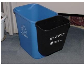
Blue Mixed Recycling Can with Black Trash Caddie